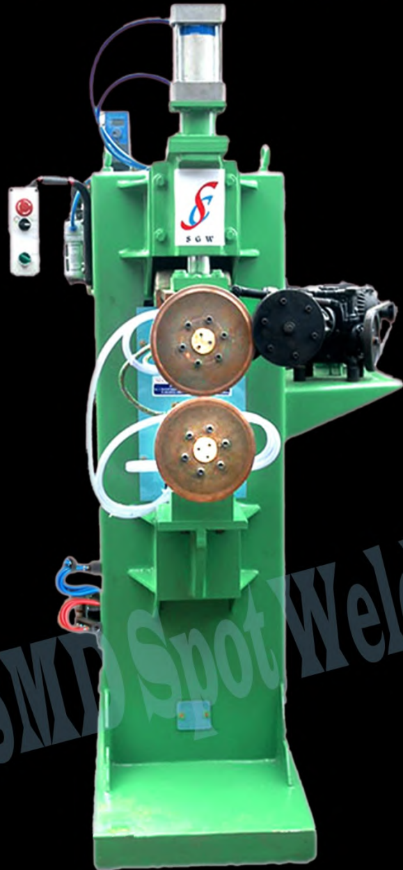
Circular seam welding machine